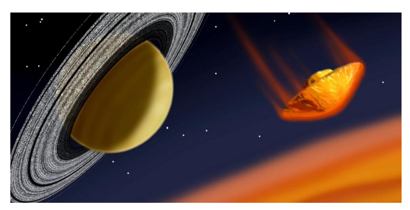
Before its parachutes open, Huygens begins to fall through Titan's atmosphere.

Which of Saturn's moons would you most like to visit? Why?