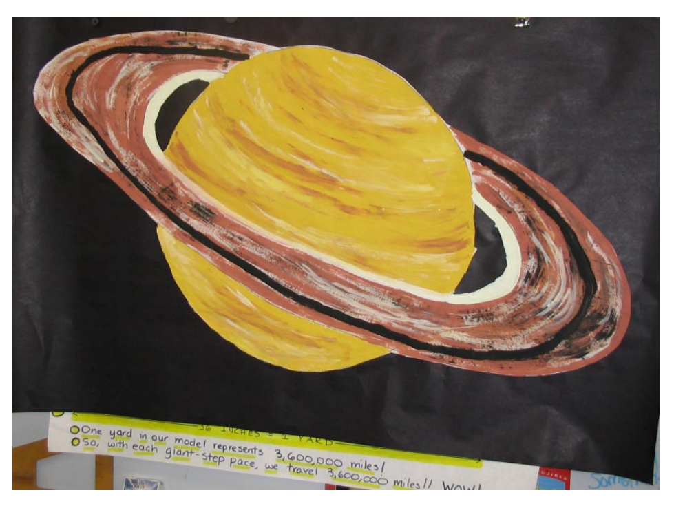
Giant Saturn poster