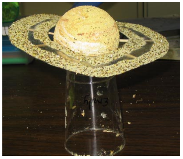
3-D model of Saturn